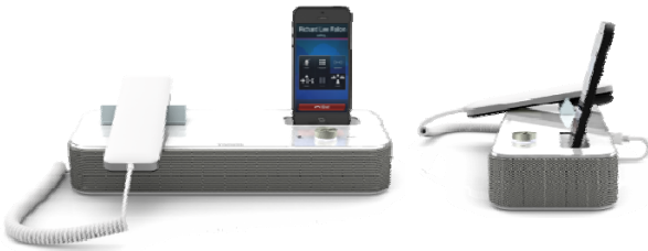
Smart Office Phone by invoxia: Smart IP desktop and conference phone.