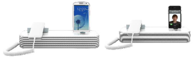
AudiOffice by invoxia: dock for voice and music

High resolution images: www.invoxia.com/press